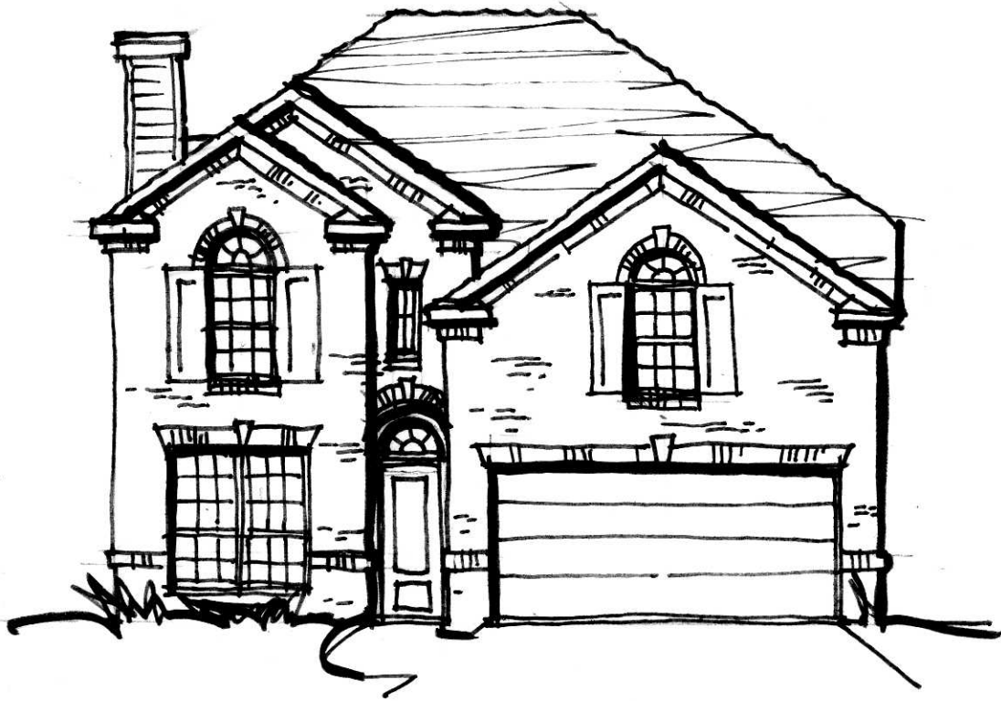
ELEVATION A FC-2900